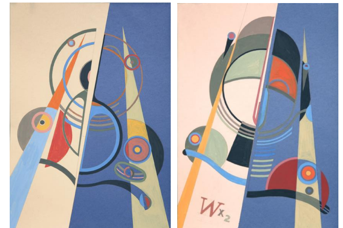
From Series “Techno-zone”, 2015