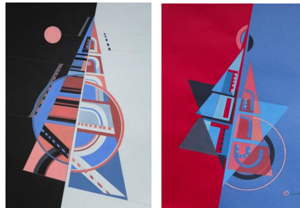
From Series Biblical Names, 2016